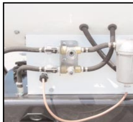
External Fuel Kit (allows access to external fuel source) #ACC-TK300