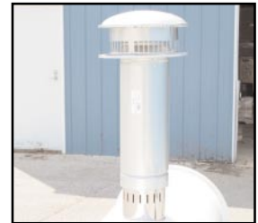
Flue Duct Kit (with rain cap) #EF1