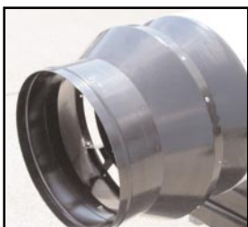
Single Outlet Adaptor #AR401