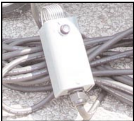
Remote Thermostat (with 50' cord) #ACC-THIDF