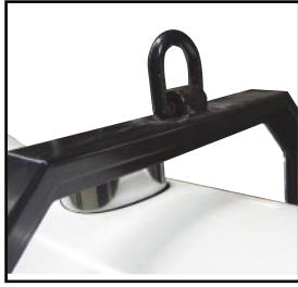
Single Lift Point Bracket