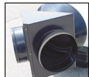
2-way Outlet Adaptor #AR402