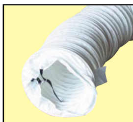
Duct 20" x 25' for single outlet #WD2025 18" x 25' for 2-way outlet #WD1825