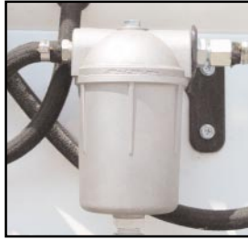
Preheated Fuel Filter