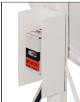
Electric Switch With Protective Cover