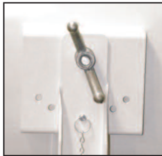
5 Fan Positions For Directing Airflow