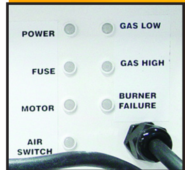
Self-diagnostic Troubleshooting Lights